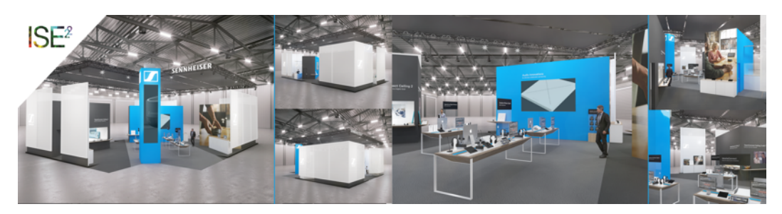
Sennheiser Brings Focus on Unified Communications and Versatile Partner Ecosystem to ISE 2022 in Barcelona

The company's ability to bring people together through customer-oriented audio innovations and an expanding partner roster will be on display at ISE 2022